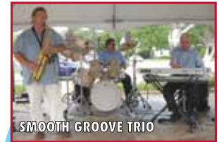
SMOOTH GROOVE TRIO