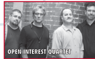
OPEN INTEREST QUARTET

at PLYMOUTH ARTS CENTER 5 p.m. - 8:30 p.m.