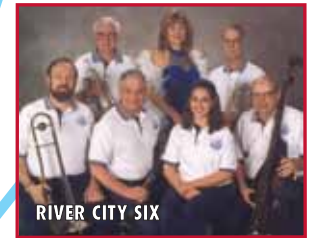
RIVER CITY SIX

7:30 p.m. - 11 p.m. at PLYMOUTH ARTS CENTER (Courtyard)