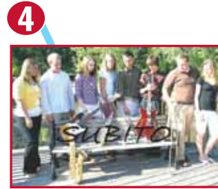
EXCHANGE BANK COFFEEHOUSE