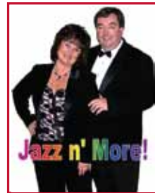
Jazz n' More!