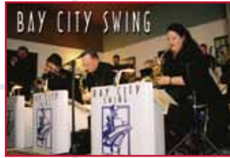
BAY CITY SWING